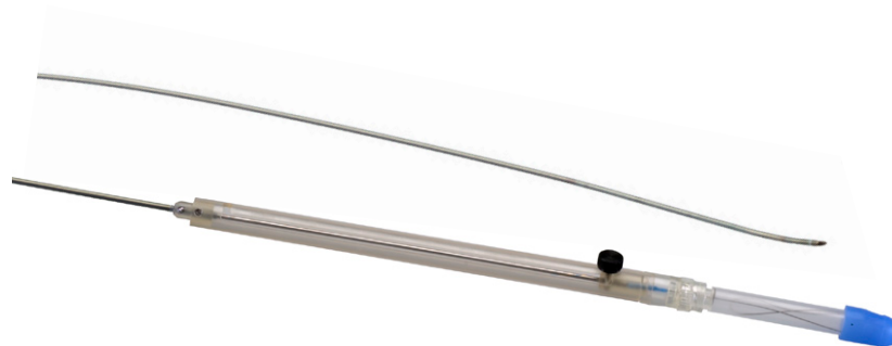
g-Cath™ Tissue Anchor Delivery Catheter